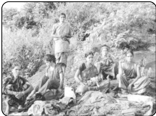
Terrified and shelterless in the forest

The Sangh Parivar insisted in taking the dead body of Lakshmanananda to Chakapada by road. They wanted to make a spectacle of it, and were prepared - as events were to prove - to take full advantage of the passions that would arouse. They did not even go