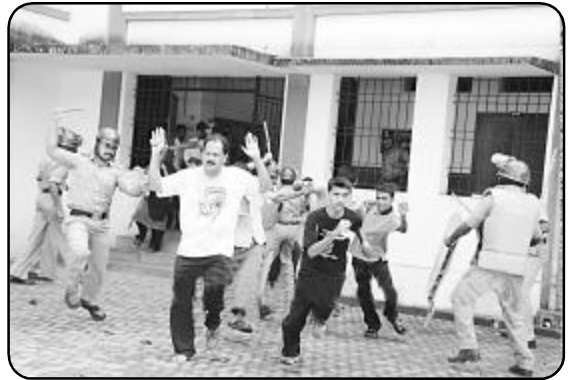
Police caning at the Holy Cross Church, Kulsekhar in Mangalore

In the midst of the terrifying assault some people managed to get a good video of the attack by the police at Permanner. It shows the police chasing the people to every nook and corner of the compound and church, and beating them like animals. This action was entirely unjustified. The Christians would at the most have undertaken a procession or a rasta roko, which they had a right to do, given the wanton assault of the day before, and