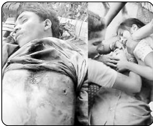
Victims of Sangh Parivar violence