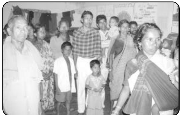
Refugees at the Daringabadi relief camp

It is worth remarking that these attacks took place while prohibitory orders were in force. Prohibitory orders under Sec.144 Cr.P.C were promulgated all over the district on 25th August, and curfew was in force in the troubled areas thereafter. But this made no difference to the assailants. Hundreds of well grown trees were felled and the main roads were all blocked. The Press reported that as of