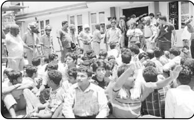
Christian youth dragged out of the St. Sebastian Church and taunted by the police

the police could have ascertained their plan and persuaded them to keep it peaceful. The police instead revealed their bias by treating the wronged as the wrong doers, even as the Bajrang Dal persons accompanied the police in this suppressive activity, and created excuses for the police to enter the fray with their lathis.