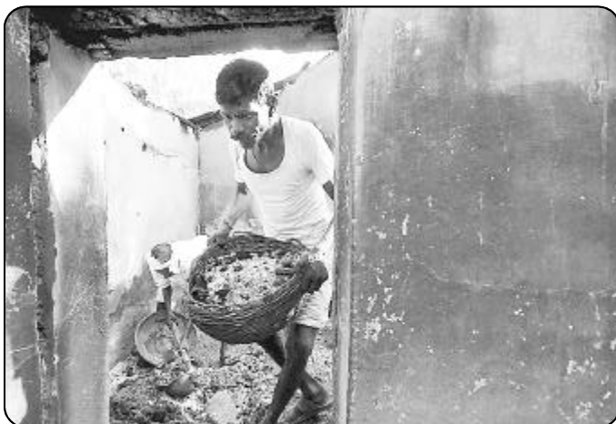
Charred debris being cleared from the house where six Muslims were burnt alive on Oct. 10, 2008 in Vatoli village near Bhainsa in Adilabad district of Andhra Pradesh

advantage of his moving away, the processionists suddenly changed the recorded cassette to 'Mandir wahin banayenge, Ram teri kasam', sung in aggressive tones. The reference, of course, is to the Ram temple at the site of the demolished Babri Masjid at Ayodhya. The SI of Police then went back and told the processionists to change the cassette. The reply again was: 'Is this not our country'? When he tried to tell them that it was their country too, the further question was: 'Are you not a Hindu?' Then the