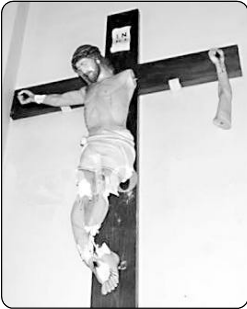
The damaged plaster of paris figure of Jesus Christ at the Adoration Center, Milagres in Mangalore

perhaps of significance considering the widespread comment about the saffronisation of the police. The suspicion of the nationalist credentials of the minorities is the trade mark of the Parivar. Indeed, some of our team members faced a question from the policeman standing guard outside the Adoration Center, which would have been expected from a Sangh Parivar member but sounded odd coming from him. When they explained that we were a human rights team, his immediate response was: have you been to Assam? That was the period when clashes between Bangladeshi immigrants and Bodo tribals in Assam were being reported in the Press, and the Sangh Parivar's gloss on the violence, namely that the illegal Muslim immigrants were responsible for the clashes, was carried prominently, especially in the substantially pro-Sangh Parivar Kannada Press.