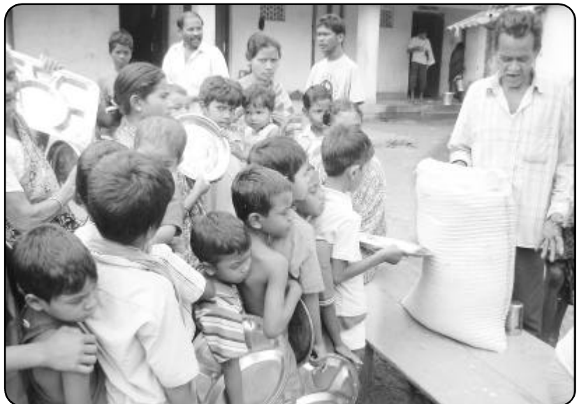
Food line at the YMCA shelter in Bhubaneswar

Having seen the qualitative picture, we may see the official statistics of the magnitude of the violence. At the end of December 2008, the government of Orissa says that 698 FIRs have been registered, naming 11,348 accused and eight times that number of 'unknown' participants in the attacks. The number arrested are just 700. As for deaths, the Government adamantly sticks to the number 39 though concerned activists put it at 58. The number of displaced persons has been reduced from the high of 23,000 to no more than 10,000 but that is by forcing them to leave the relief camps without ensuring that they can go back and live with dig-