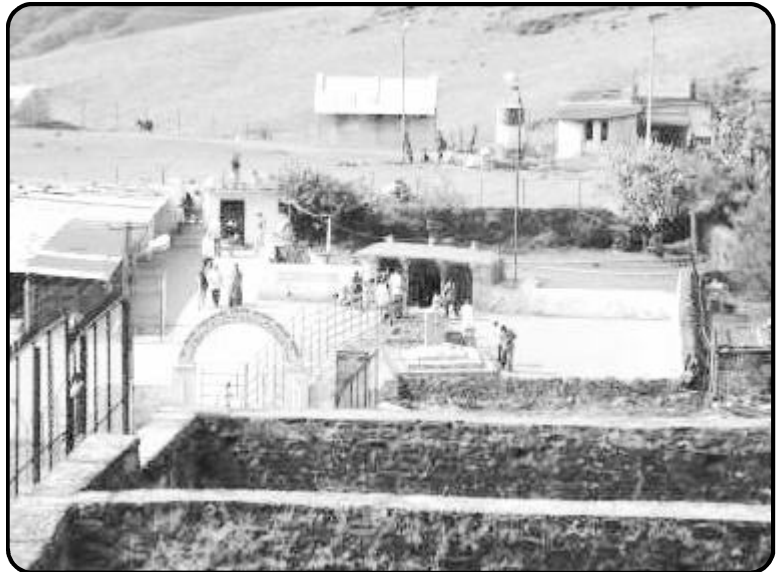
Baba Budangiri dargah

The 'second Ayodhya' is a shrine called Baba Budangiri in Chikmagalur district abutting the Western Ghats. It is the dargah of a Sufi saint, Baba Budan* (Hazrath Dada Hayaath Meer Kalandhar), located 30 kms from Chikmagalur. It has been a sacred place for not only Muslims but the dalit and shudra communities among the Hindus as well, as is indeed true of most Sufi shrines. The State Government's decision to proclaim it a Wakf led to litigation in which the final result appears to be that its sacred character for Muslims as well as Hindus was recognized and so was the trusteeship of the Muslim family which was managing it. Status quo as obtaining prior to 1975 was directed to be maintained.