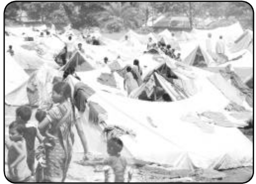
One of the relief camps in Kandhamal