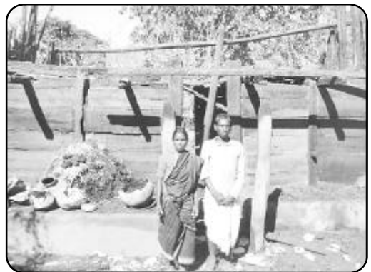
A Christian couple outside their destroyed home in Kosanga village of Tikabali Block