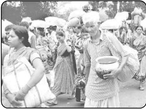
The exodus of Christians from their villages in Kandhamal

understood him right. As soon as he was out of sight of the town his vehicle turned left and moved towards what we were later told was a 'view point' from where tourists could enjoy the surrounding hills and valleys. Its merit for his purpose was that it was out of sight of not only Daringabadi but also the road from Daringabadi to Baliguda. He stopped at the 'view point' (alas, there was too little light for us to enjoy the view, even if we were in the mood for it) along with some associates of his who had also followed him, and only then did he open up. What he said was less remarkable