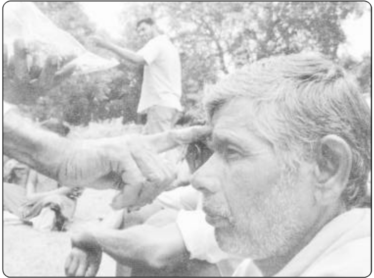
Being converted to Hinduism

when we met him on 11th October. The victim would be tonsured and tilak put on the forehead. He would have to consume 'gobar paani' (cow dung mixed with water) and would then be fed ghee rice. He would have to tear or burn the bible and put his signature to a paper declaring that if he ever went to a church again, it was the same as if he was dead. Interestingly, there is no wearing of the sacred thread and recitation of gayatri when a dalit Christian is forcibly converted, unlike when an enthusiastic adivasi is given religion.