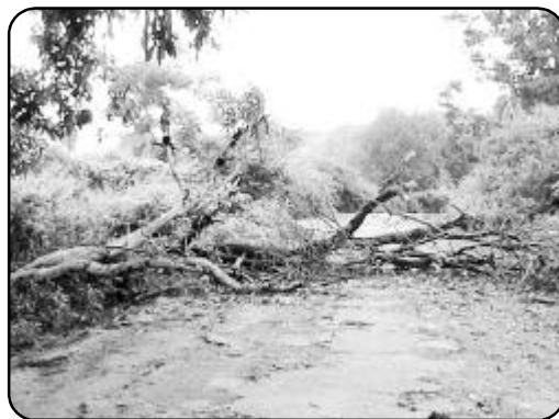
Trees felled and placed across the road by Bajrang Dal enroute Raikia

Jalespeta, arrangements could have been made to airlift the body to Chakapada. Moreover, the route actually taken was not the route agreed upon. The followers of the slain Lakshmananda at K.Nuagaon put pressure upon the organizers of the procession to take the body by a lengthier route so that all could have darshan. The administration should have realized, given the history of Lakshmanananda's activity that this would multiply the damage that could be caused by the exhibition of the dead body. But then we found that the administration in Orissa was handling the rioters most gingerly, as if not